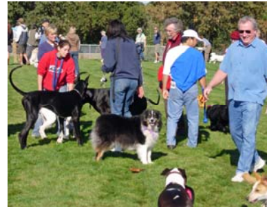
Happy first visitors to the park meet and greet