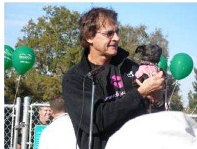
Tony La Russa, founder of Animal Rescue Foundation (ARF), offers congratulations